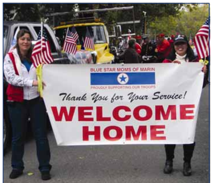
Blue Star Moms at the Petaluma Veteran's Day Parade.