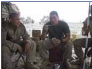
Troops at lunch

“My son called today and told me his favorite thing out of boxes was the scarf! THANK YOU- to the knitting group who takes the time to make them for our soldiers! My soldier “LOVES” (word he said) his scarf and hat! Thanks Blue Star Mom's of Marin for sending my son packages!!”