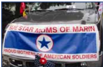
One of the many ways Blue Star Moms of Marin supports our troops.