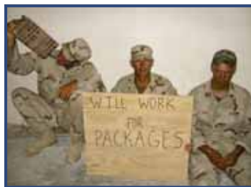
Will work for packages

From a Soldier serving at Speicher - North in Iraq: