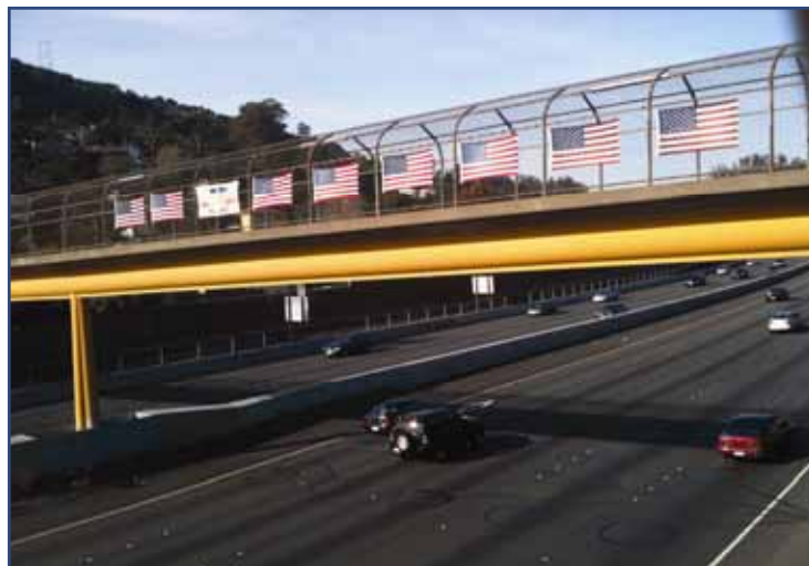
Freeway overpass Welcome Home tribute from Blue Star Moms

Follow us on facebook, attend our meetings, and contact us. We will keep uncovering important and worthwhile needs and will be putting those opportunities out there for those who want to help. Many, many thanks to all who have helped and continue to do so.