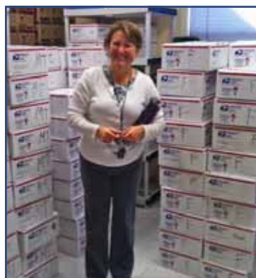
Packed and ready to mail