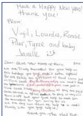
A heart-felt thank you