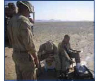
Troops at lunch

"My Favorite Marine told me to please thank the Blue Star Moms. He said the packages sent to 3/7 were a 'huuuuuge' hit! The guys found the letters from the school children to be very cute and funny. They want to write back to these kids. He is going to send me all of the letters the guys write and I will give them to whomever got these from the kids at the different schools, so they can receive letters back from my son and his fellow Marines."