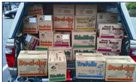
Donated Girl Scout cookies head for Travis AFB, then Afghanistan.

May 28 th Memorial Day Celebrations, events TBA