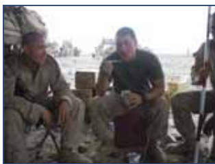
Troops at lunch

“My son called today and told me his favorite thing out of boxes was the scarf! THANK YOU- to the knitting group who takes the time to make them for our soldiers! My soldier “LOVES” (word he said) his scarf and hat! Thanks Blue Star Mom's of Marin for sending my son packages!!”