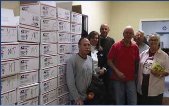
Community Members joining in with BSMS