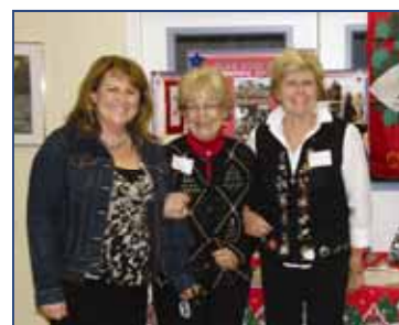
BSM Holiday Party, socializing and adopt a family

God Bless all of you and your families and special prayers for our children serving overseas. Keep them safe and well.