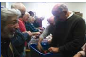
Novato Rotarians help pack

overseas! Our total mailings to troops tops 3,000 posted.